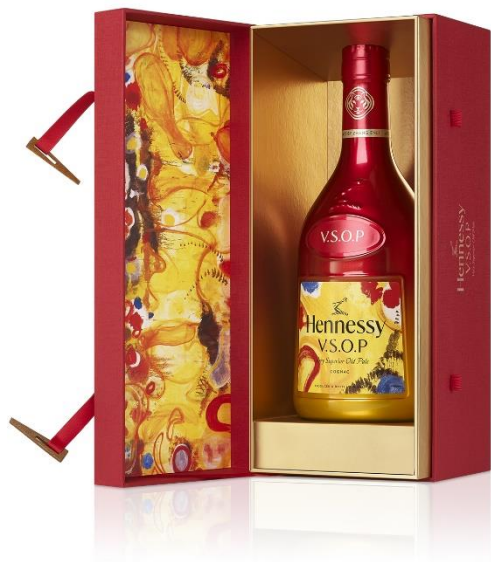
Giftbox Hennessy V.S.O.P by Zhang Enli