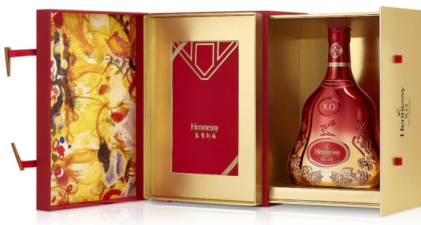
Giftbox Hennessy X.O by Zhang Enli