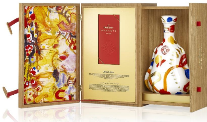
Giftbox Hennessy Paradis by Zhang Enli